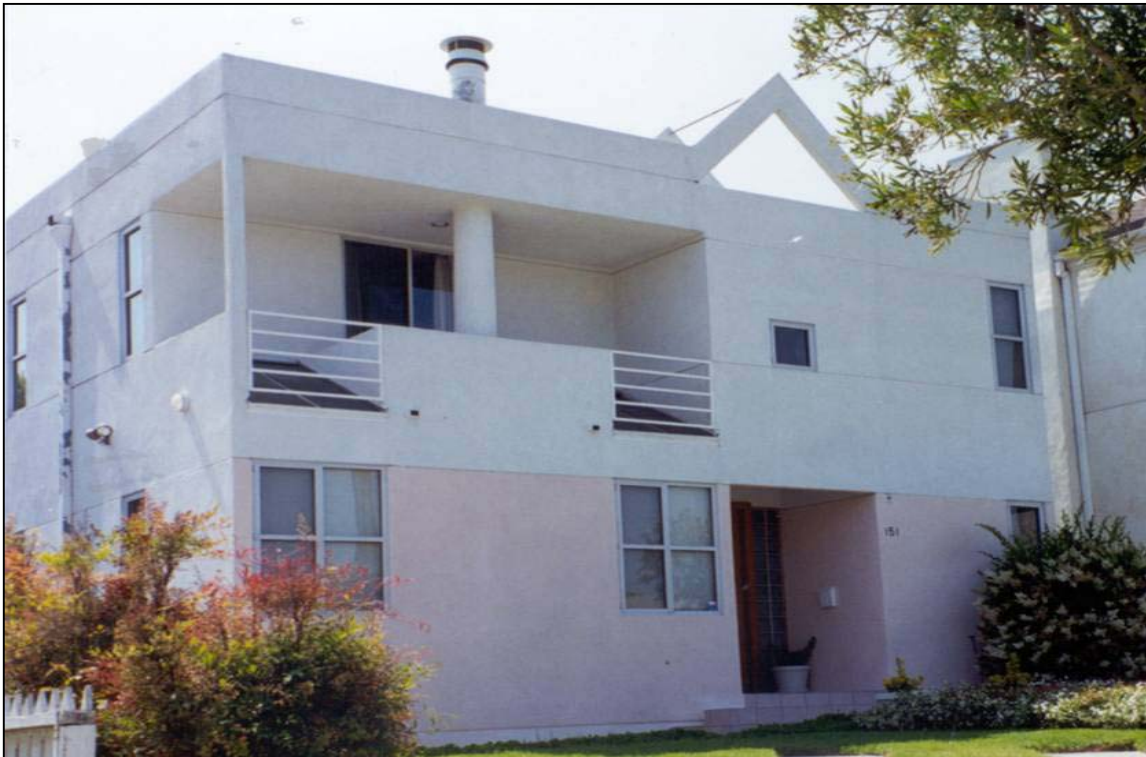
Photograph illustrates typical proportions, details, and materials associated with the style. Residence pictured is located on a property approximately 50 feet in width.

(Appropriate for lots 60 feet in width and smaller)